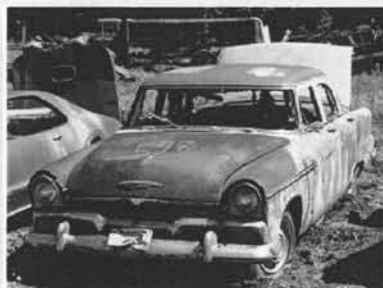
A '55 ready for restoration