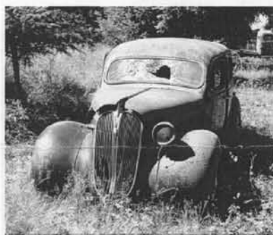
This '33 needs a new & loving home