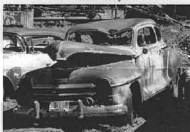
A '46 in the classic "rust" color