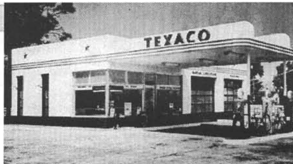
A modern "Service Station" in Palo Alto, CA

Coming next issue - Adventures in Petrolania - reminiscing on the good old days of "service" stations (before the advent of "filling" stations.)