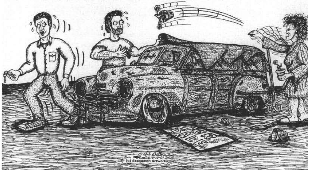
Bill Call has second thoughts about "his" Woody

The Plymouth Woody is one of the most sought after Plymouths out there today. So when I received a call that one was available I agreed to meet this fellow in a restaurant parking lot about 35 miles from my home. When I arrived there he asked me to follow him yet another 40 miles up in the mountains as it was at this ranch. We went up and down through the countryside until we finally came upon this old wired-up gate. We went through and proceeded up a dirt road to the top of the hill where there were at least 20 old cars in various conditions strewn