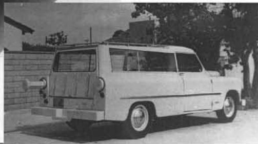
Publicity shot of the Powell Station Wagon