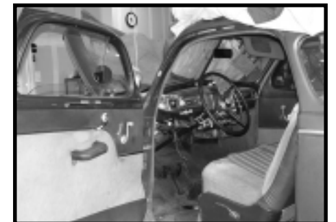
The interior of the '47 is still in great shape