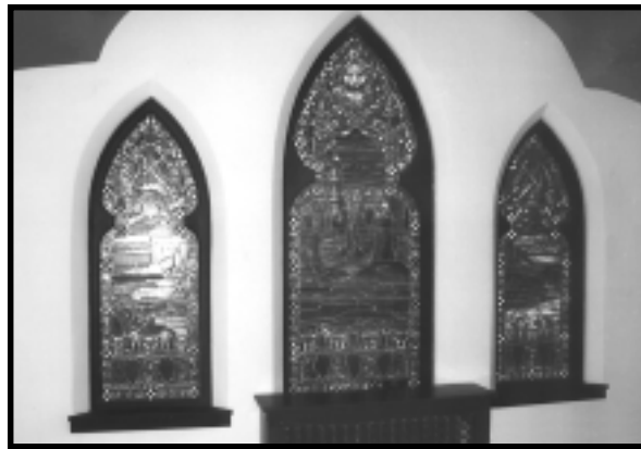
Photo taken on tour of Elsinore Theatre