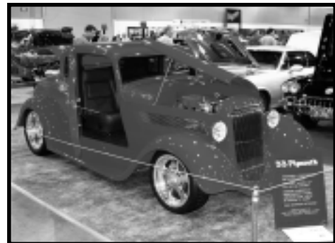
1933 Plymouth Coupe Owners live in Gladstone, OR

A monthly feature to the CPPC club newsletter is called "Plymouths, Out and About". Sightings of Plymouths, and general location, and when they were seen.