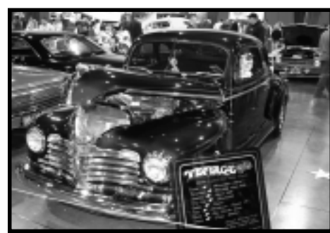
1947 Plymouth Business Coupe Owners live in, Vancouver, WA

Let's get to work this upcoming year and see if you can get more Plymouths in the Roadster Show.