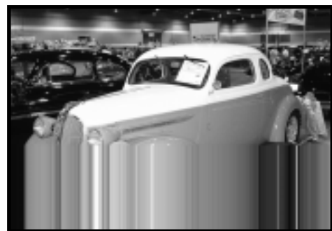
1937 Plymouth Coupe Owners live in, Gresham, OR

This month was the Annual Portland Roadster show, at the Portland Exposition Center Feb. 18-20.