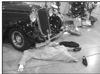
Grandma provided a lot of fun with passers by.