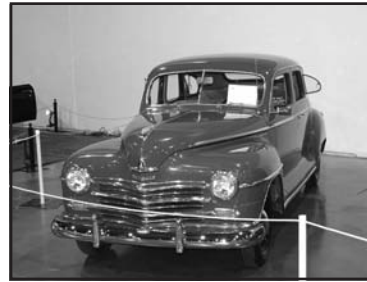
Jack Redding's 1946 Plymouth

1946 Plymouth 4Dr. Special Deluxe Restored to original condition. Mandarin Maroon with 2 tone Charcoal Gray interior. Most everything has been either rebuilt or replaced with new items. Ready to drive and enjoy. $9,995.00 o.b.o. Jack Redding PH:503-513-5526