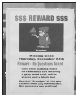
"Reward Sign" for whereabouts of Grandma