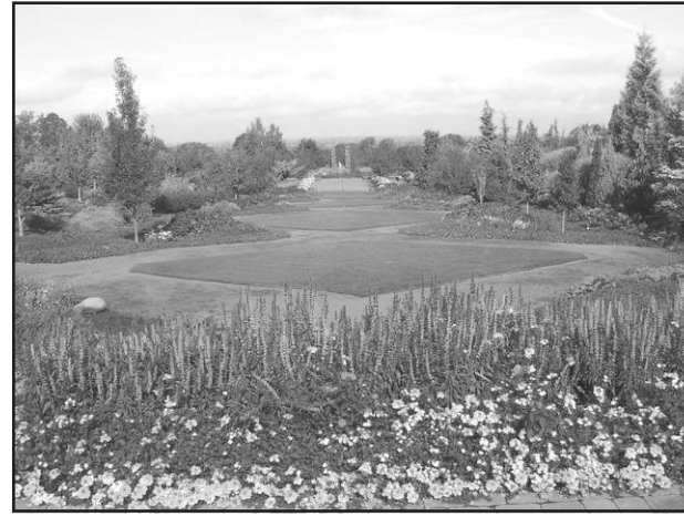
View of Oregon Gardens

The December tour will be lunch at the Albertina Kerr Center at 1:15PM on Thursday, December 8 th (424 NE 22 nd ). Lunch is $9.00 and beverages and tip is extra.