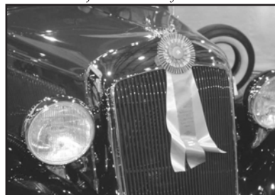
CPPC Receives one of eight Ribbons for our Display