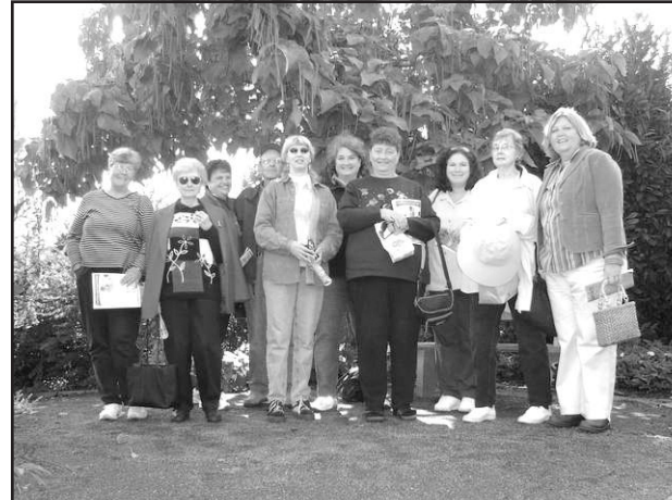
Mayflowers have another great Event at the Oregon Gardens.