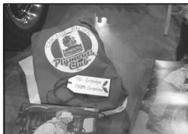
Some Good CPPC Member will get a Club Sweatshirt from Santa this year.