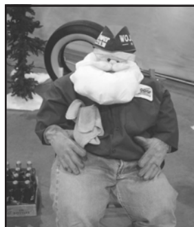
Grandpa Greet visitors to the CPPC Club's Booth