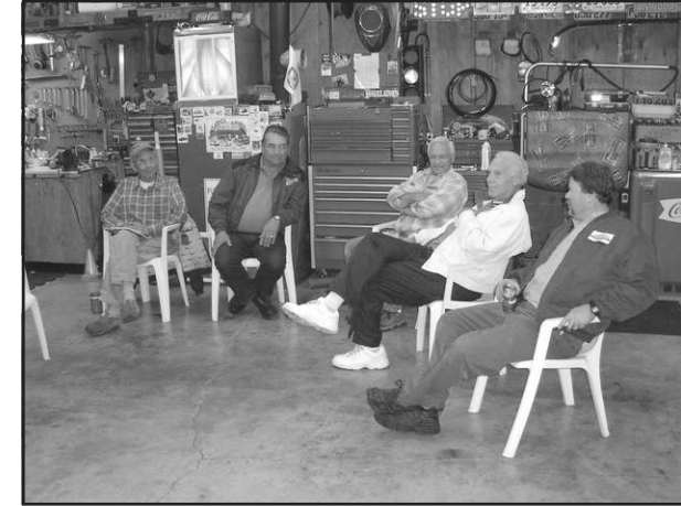
CPPC Members ponder car related issues at October Technical Committee Meeting