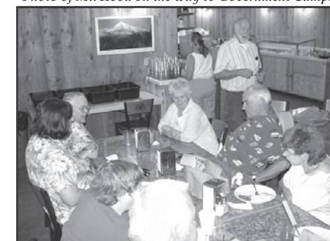
Everyone had their fill at the Buffet Lunch.