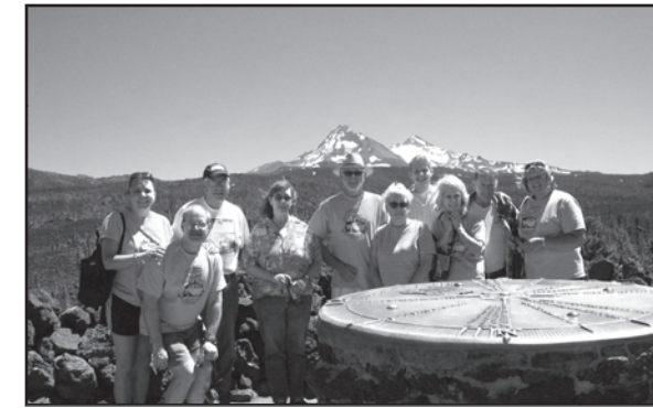
Another photo opportunity at Dee Wright Observatory