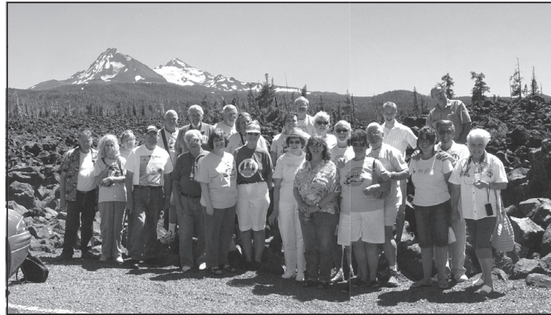
CPPC Members pose for a group shot at the Dee Wright Observatory, what a beautiful back drop on this sunny day.

We still had more of the "scenic" (i.e. scary) highway into Sisters. The Marble car had a little vapor lock problem leaving the day use site but headed downhill for an easy start and rejoined the group at the Dee Wright Observatory.