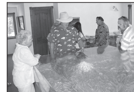
Three Dimensional Map of Mt. Hood area.