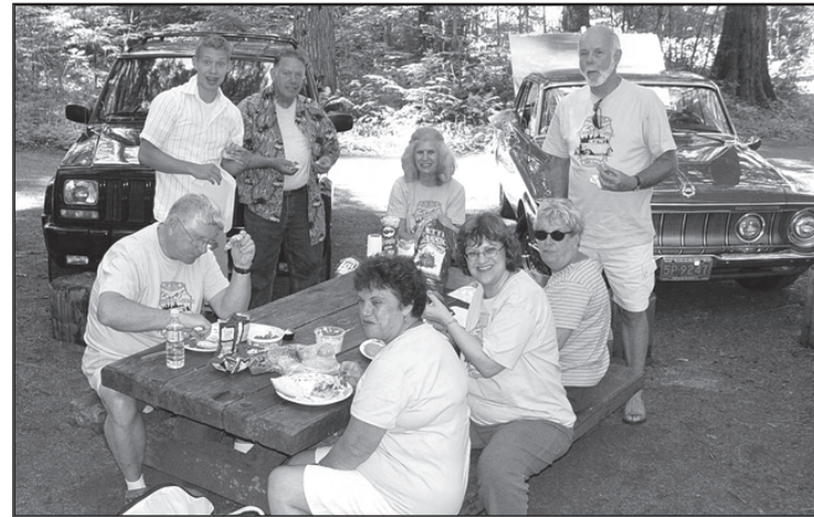
Lunch break at the Limberlost Campground