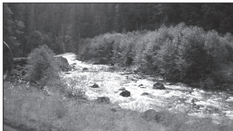
You can't find seantry like this until you hit the "Backroads of the Cascades"