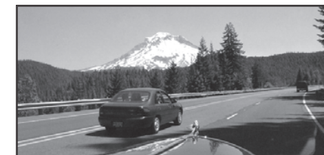
Photo of Mt. Hood on the way to Government Camp.