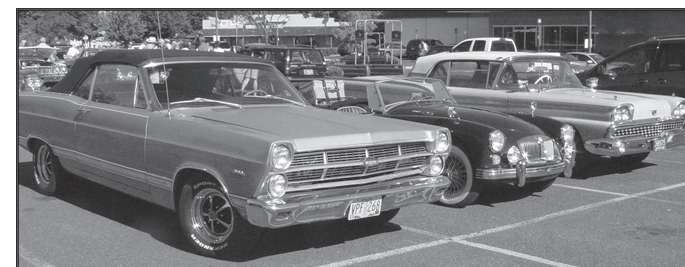
Some of the CPCC and HACO members cars.