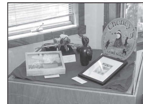
One of the museums many historical displays

Plymouth is a registered trademark of Chrysler Motors and is used by special Permission