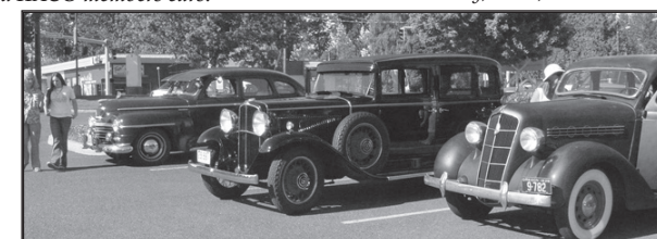
Some more of the CPCC and HACO members cars