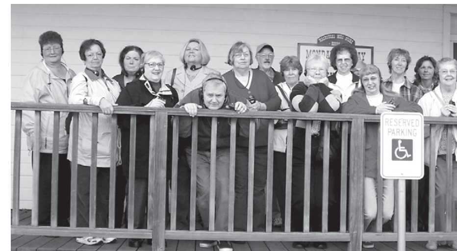
The latest Mayflower group gathers at the Pendleton Woolen Mill in Washougal, WA with their head phones on ready to start their tour on March 12.