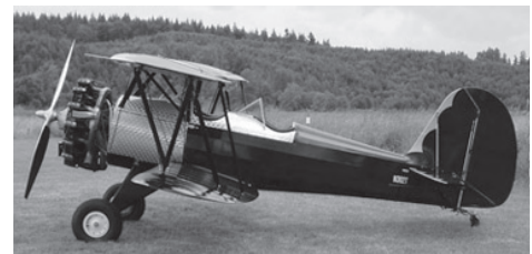
1937 radial engine biplane

We noticed a 1937 radial engine biplane sitting at the end of a grass landing strip as we entered. After we had our chairs unfolded and our potluck contributions deposited on the long, long table provided, a fellow hand-propped the engine on that biplane, and the pilot took off right down the runway beside our cars. He climbed and banked