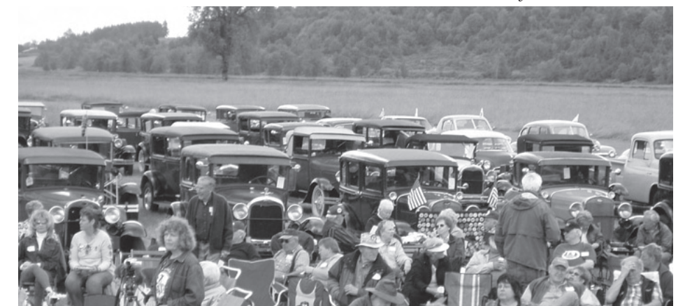
It was a "sea of Model As" on Fletcher Anderson's property. Plymouth people are in the lower right area and their cars are on the outside edge with the flags.