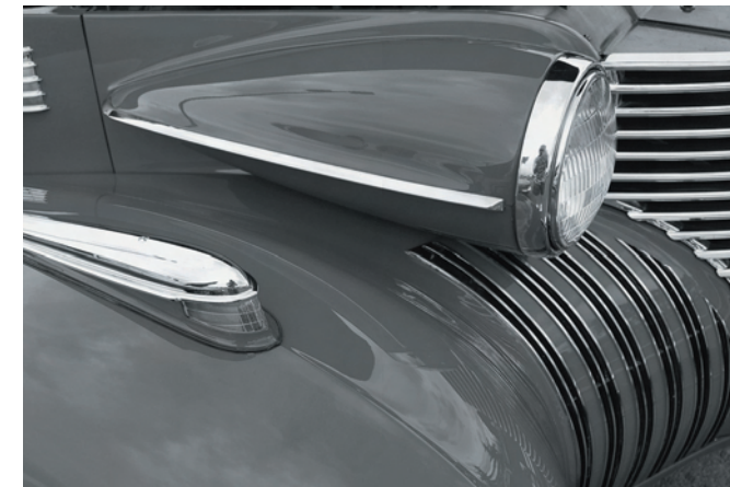
Headlight - Side