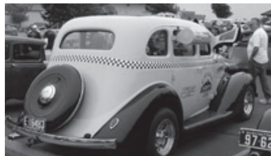
Plymouth Taxi Cab