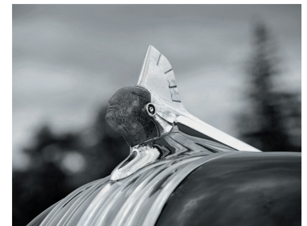
Pontiac Hood Ornament