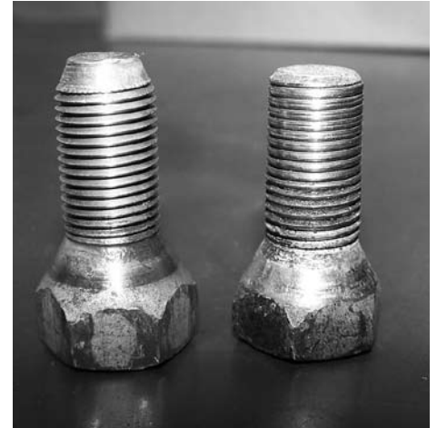
The lug bolt on the left is good to go, the one on the right is junk....

Finally, use a speeder bar to snug all wheel fasteners, then torque to specification in the proper order with a cali-