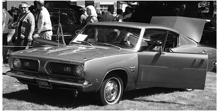
On the tree-shaded Pacific University campus for the Forest Grove Concours d'Elegance, July 19, Plymouths sat in a sunny spot right in the middle of the show. This '68 Barracuda (above) was flawless, and the '64 Fury convertible got lots of attention.