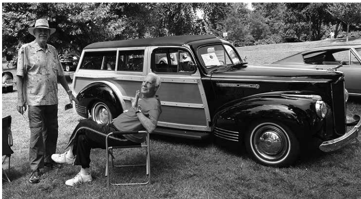
It's no secret that Plymouth P15s lend themselves to hot-rodding and customizing, and this one was stellar.