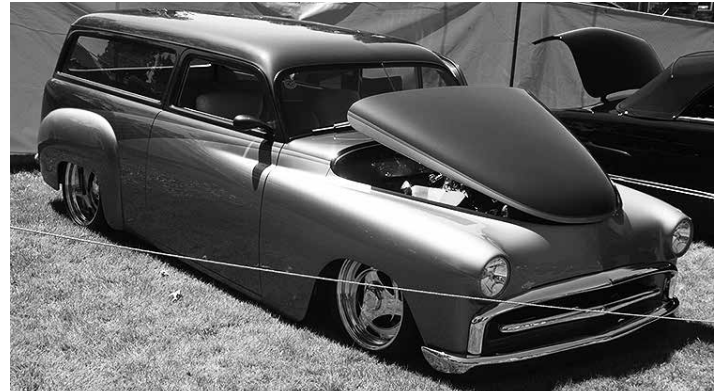
Forest Grove Concours hosted a Custom class this year, for classics of a different type, including this 'old Suburban, splendid in multiple shades of purple. We don't often put Plymouth and Elegance in the same sentence, but this car would be the exception.