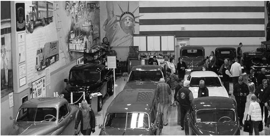
Tour at Bill's Place, March 5, 2016 – visitors tend to find the space overwhelming, between the cars, the murals, and the other items on display. Three car clubs joined the tour; about 40 people attended.