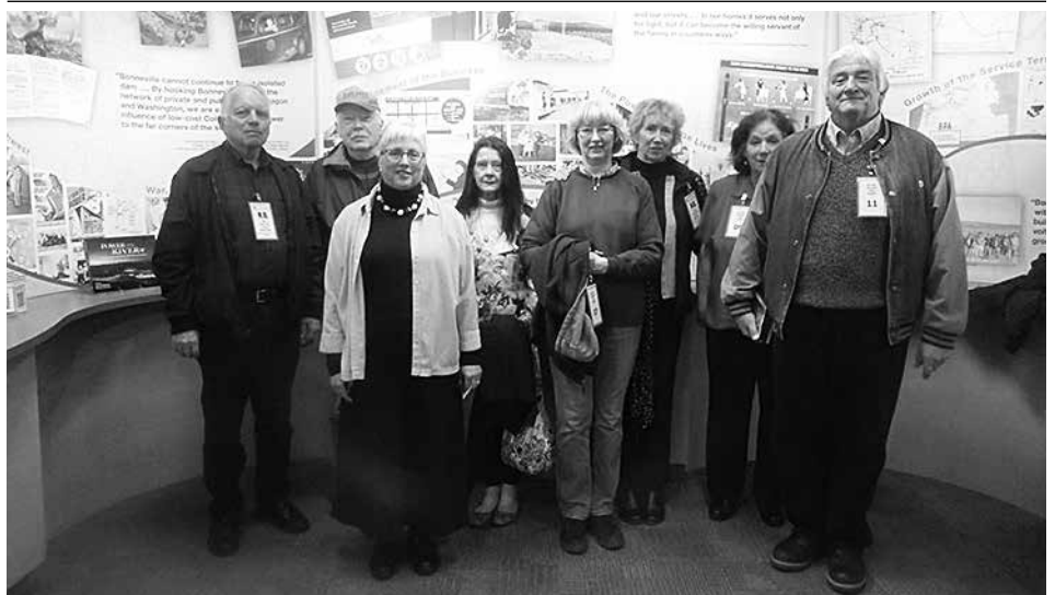
On Monday March 14th, the Mayflowers toured the new library at the visitors center at Bonneville Power Administration. BPA's archived showed them "mechanical contraptions" from the 1930's and 1940's, plus classic vehicles and museum film footage.