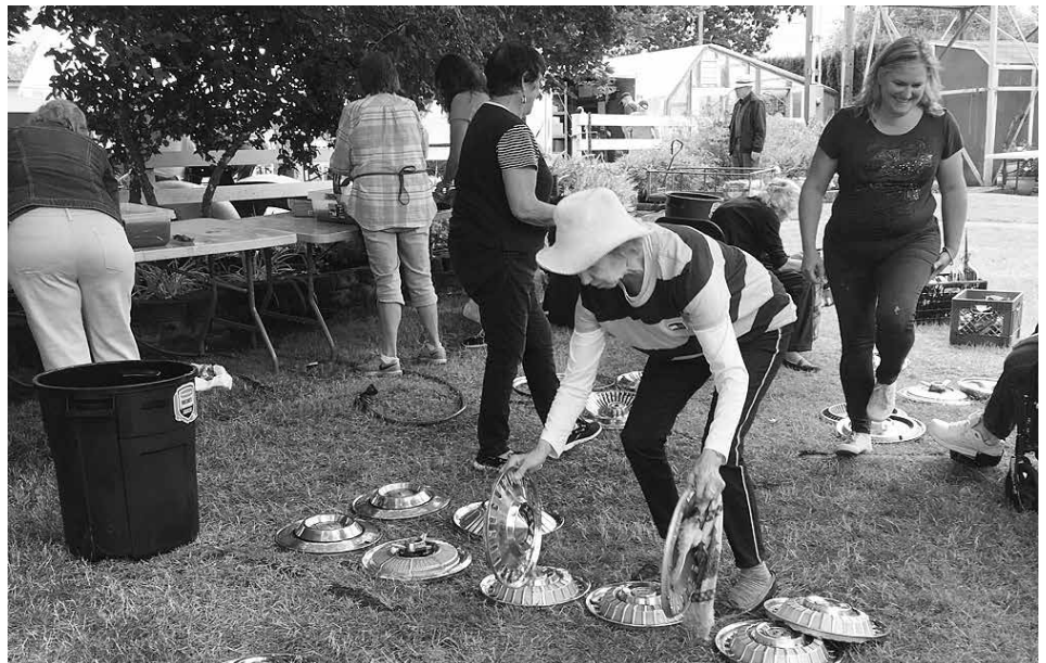
We noticed at last spring's Swap Meet that the clean, shiny stuff was selling, and the grungy things weren't. Next spring, our hubcap collection will be clean and sorted into sets, thanks to the CPPC women who rolled up their sleeves and went to work while the men were curating the inventory in the trailer.

Then our members and friends sat down to hamburgers, hot dogs, potato